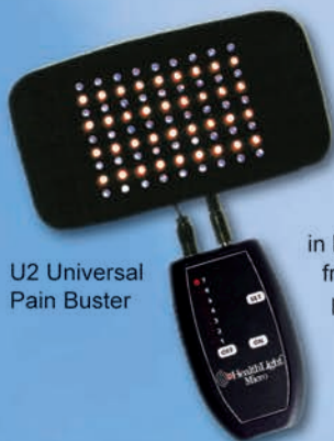
U2 Universal Pain Buster

Light therapy can be helpful in reducing chronic pain, inflammation & loss of sensation often associated with diabetic related peripheral neuropathy. As a direct result, people experience an improvement in balance which can mean less frequent falls. Other chronic pain frequently associated with fibromyalgia and other arthritic conditions, can be reduced or eliminated. Studies have shown that Infrared and Visible Red light increase mitochondrial ATP production and have a profound effect on the level of Nitric Oxide and it's role in managing pain.