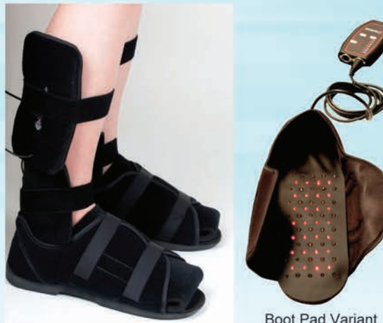
Boot Pad Variant

This unique unit comes with a pad that folds into a boot to cover the entire foot and ankle as well as one optional U1 Universal 50 diode pad for use on the leg and foot simultaneously. The unit was designed with neuropathy in mind. The boot can be opened flat to be used around the head or neck and along the spinal column.