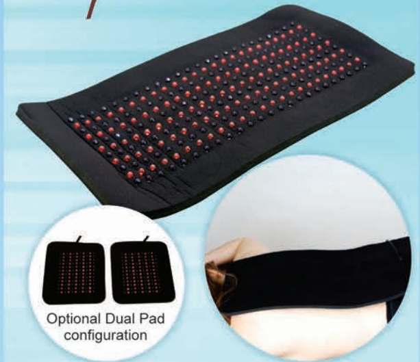
Optional Dual Pad configuration

More than 8 times the coverage of the U2 Universal! Designed to cover the length of the back or 100% of the knee or both feet simultaneously. Comes in Red and infrared or Blue and Infrared. Has 264 diodes, 7 manual settings, 1 automatic setting and auto shutoff for safety.